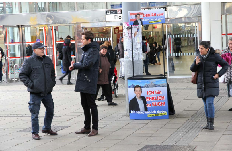
2016 / Floridsdorf / Vienna