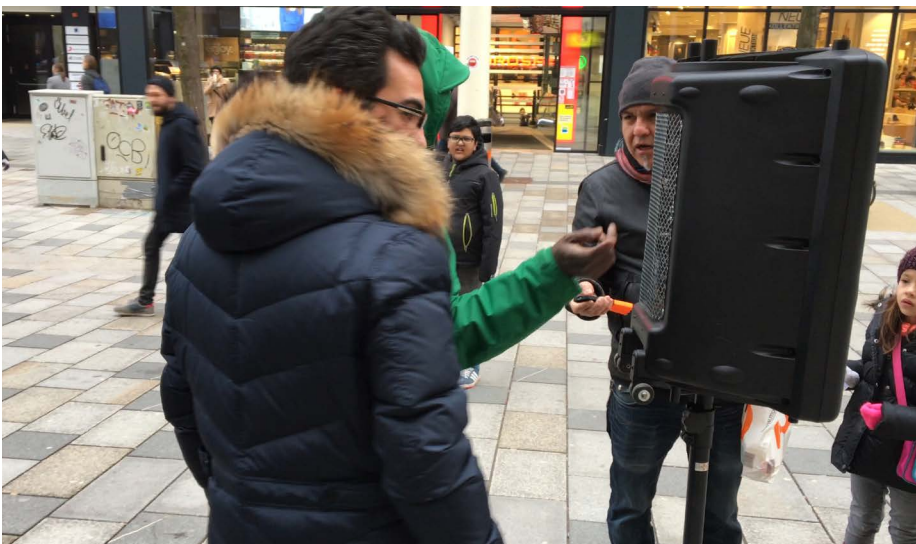
Video stills / 11.02.2017 / Vienna