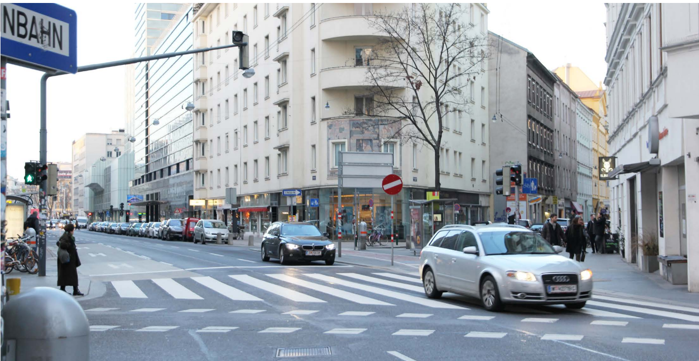
2016 / Parallel worlds / Vienna

The absolutely self-evident, which never catches our eye in everyday life, becomes immediately visible by means of minimal change.