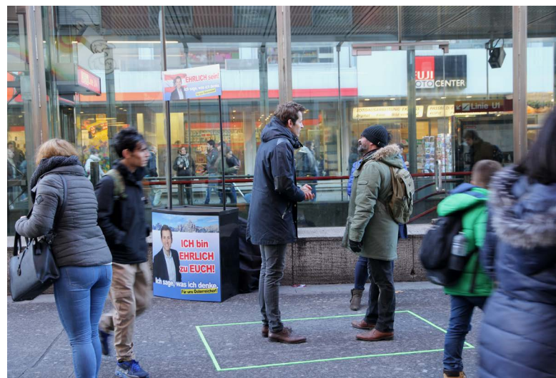
2016 / Favoriten / Vienna