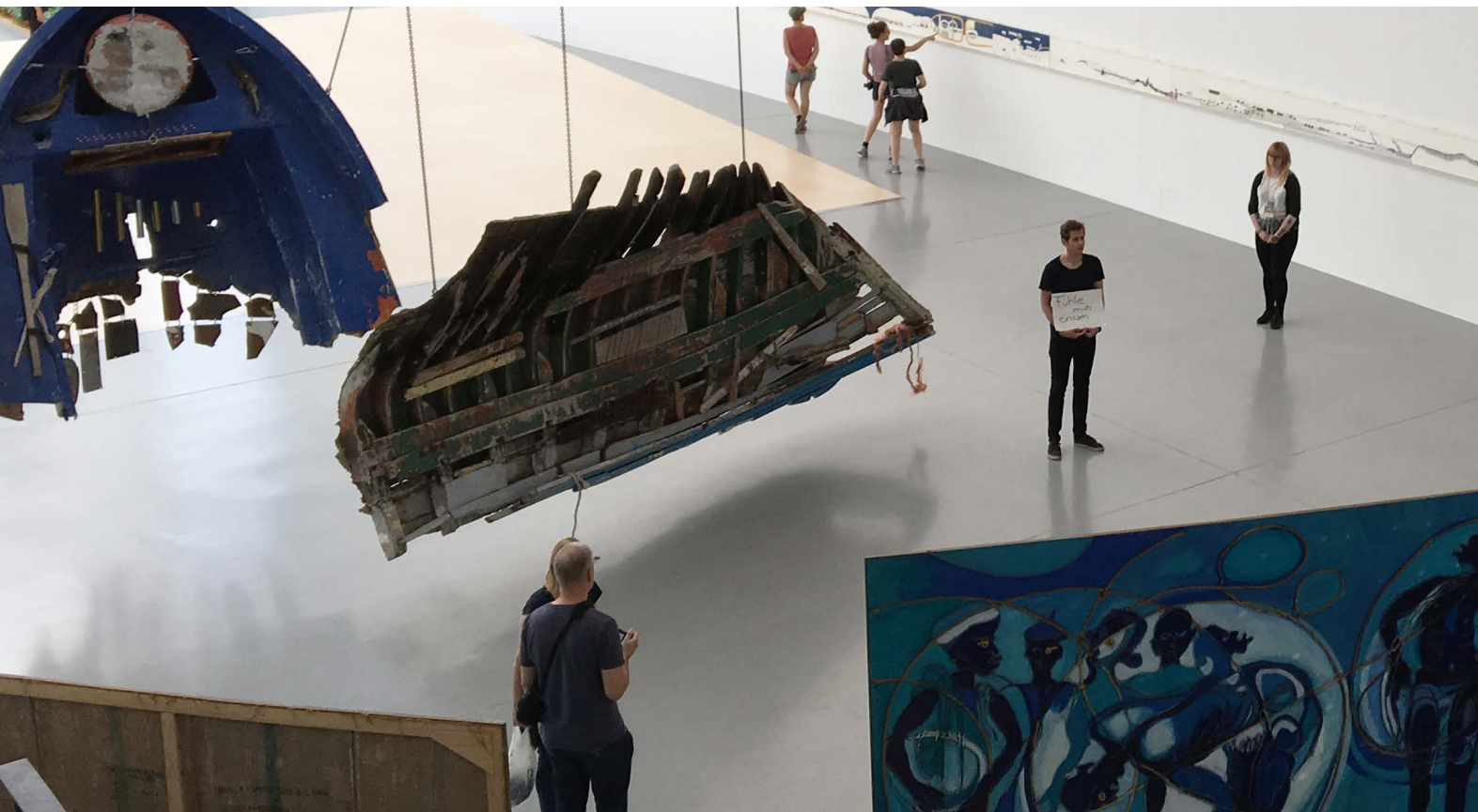
11.06.2017 / documenta Halle / Kassel