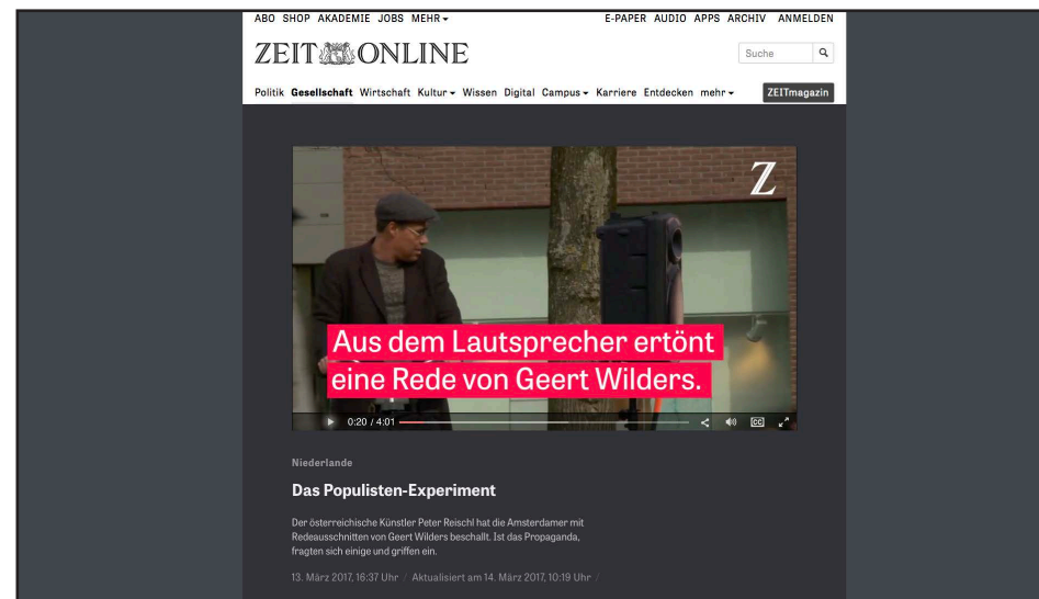
German Magazine Die ZEIT / 14.3.2017

The inauguration speech of Donald Trump from January 20, 2017 can be heard.