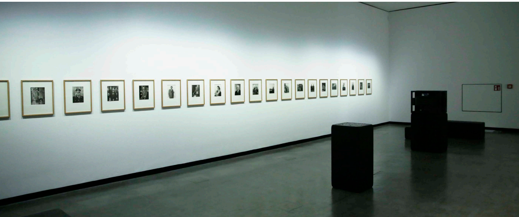
9.2017 / How to live together / Kunsthalle Wien / Photo: Benedikt Steiner

“Place your mobile phone here while looking at the artworks in this exhibition hall.”